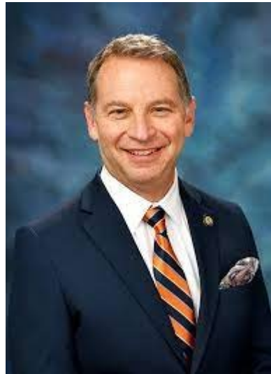
Senator Paul Faraci (D)